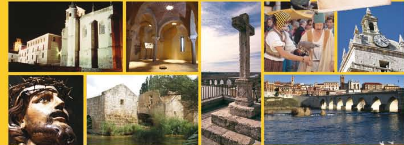
Una publicación de la Oficina Municipal de Turismo de Tordesillas Realizar: Grupo Página (☎ 983 955 111)