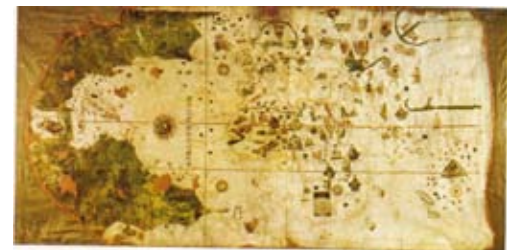
Juan de la Cosa: chart-mapamundi, 1500

In 2007 the Treaty of Tordesillas was included in the "Memory of the World Register" of UNESCO.